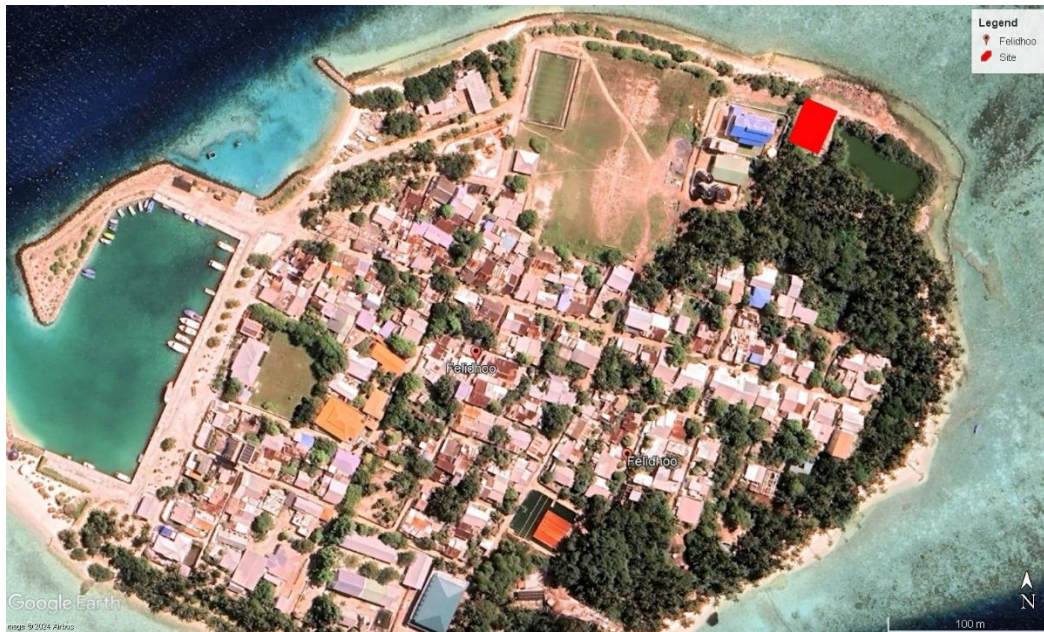
Figure 2: Proposed Site Location