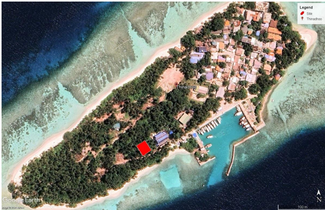
Figure 2: Proposed Site Location